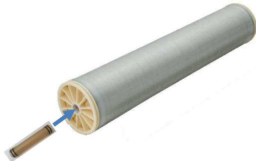
Figure 2: TMRO TS Style element uses flush cut Polysulfone permeate tube and interconnector. These connectors are like standard RO elements connectors.