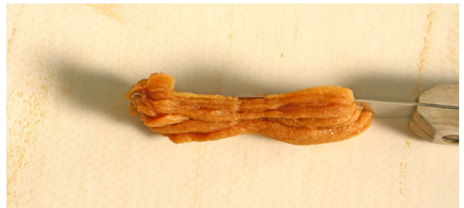
Disrupts biofilm to maintain clean membranes