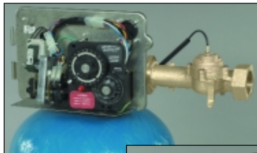
▲ FRONT WITHOUT COVER